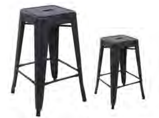
Bar Stools 24 available