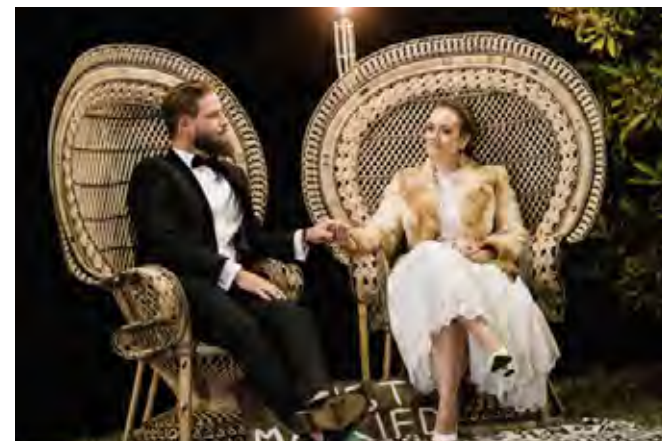
Peacock Chairs 2 available (in white)