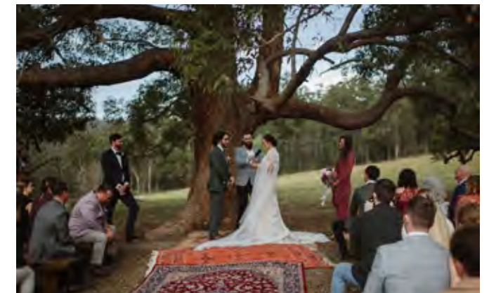
Bohemian Rugs 6 available