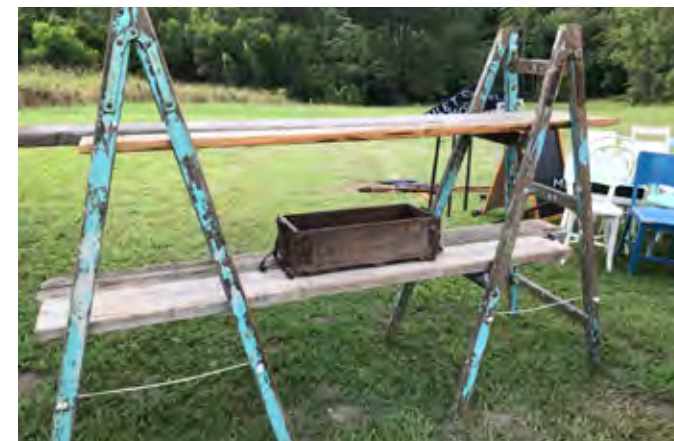
Timber Ladder Stand For Cakes, Lollies & Drinks