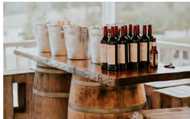
Timber Slab (for wine barrels)