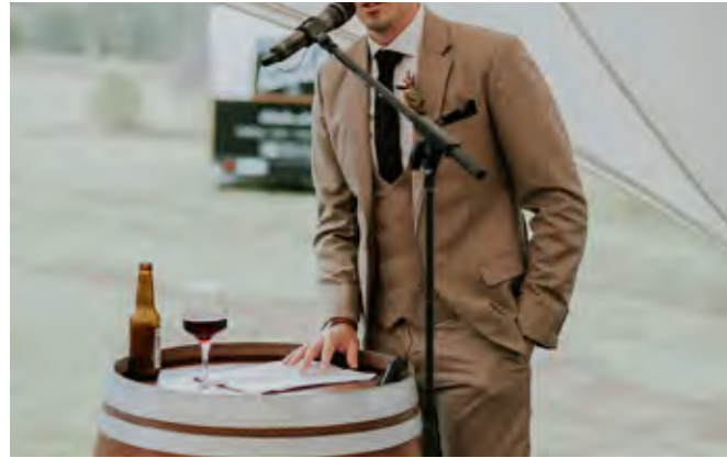
Wine Barrels 6 available