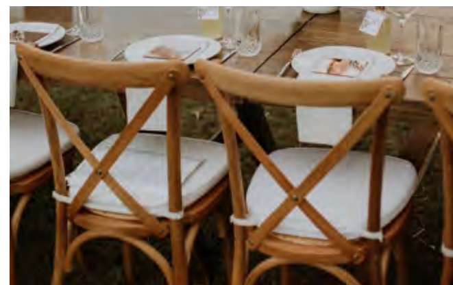
Barista Dining Chairs Up to 150 available