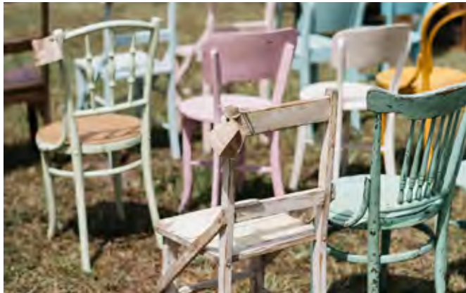
Mixed Vintage Chairs