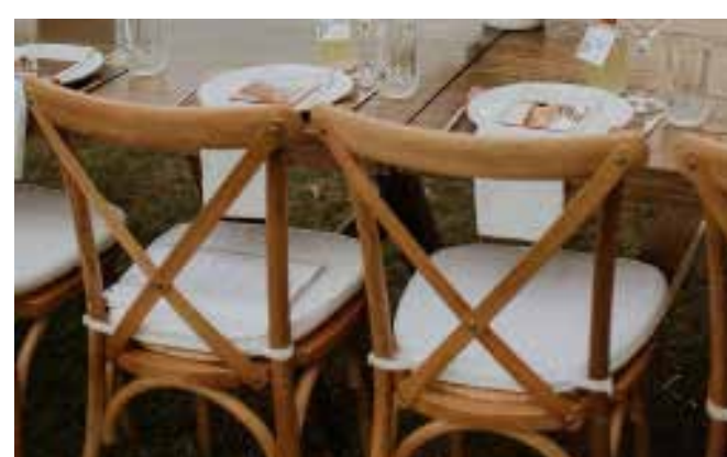
Barista Dining Chairs Up to 150 available