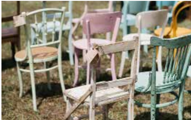
Mixed Vintage Chairs