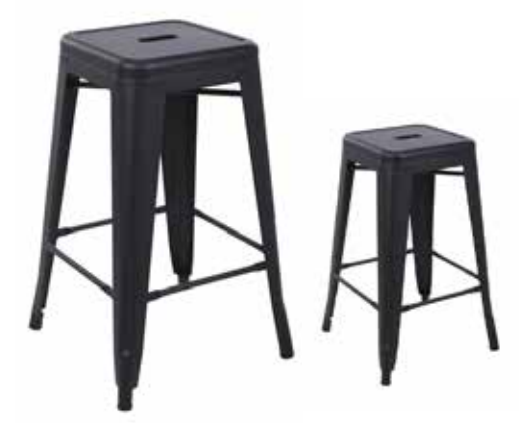
Bar Stools 24 available