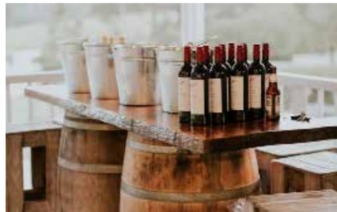
Timber Slab (for wine barrels)