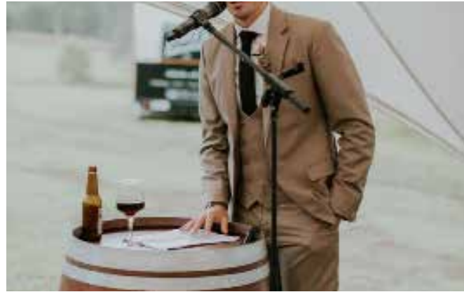
Wine Barrels 6 available