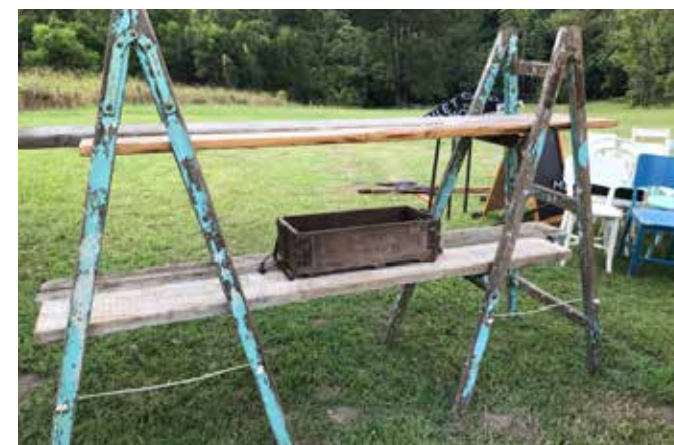
Timber Ladder Stand For Cakes, Lollies & Drinks