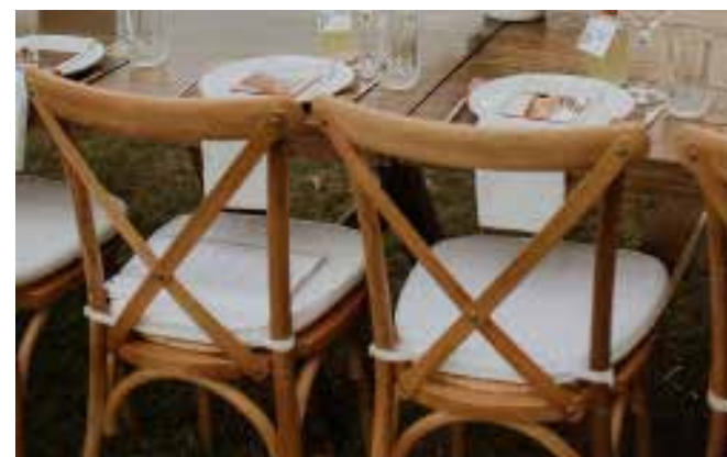
Barista Dining Chairs Up to 150 available