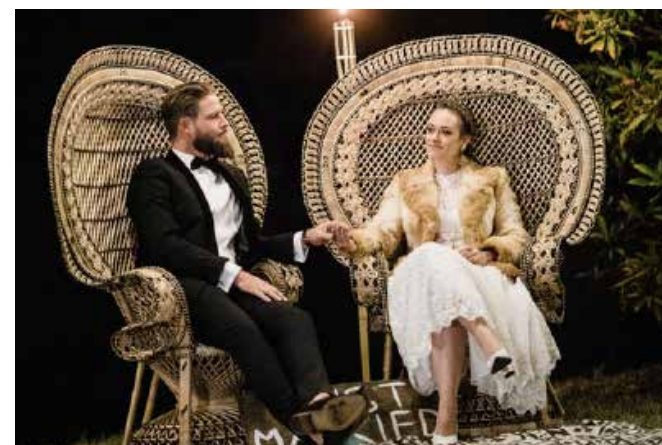
Peacock Chairs 2 available (in white)