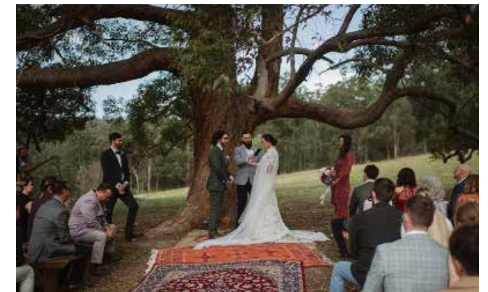
Bohemian Rugs 6 available