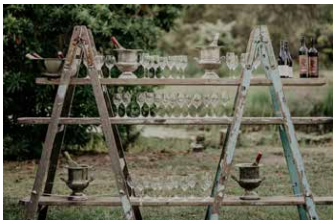
Timber Ladder Stand For Cakes, Lollies & Drinks