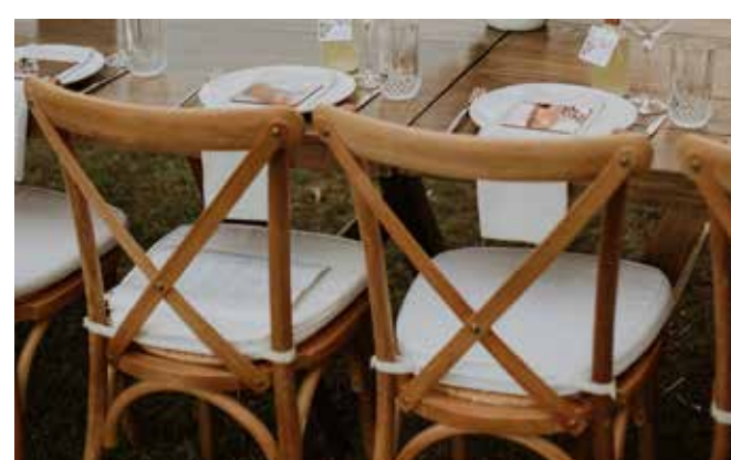
Barista Dining Chairs Up to 150 available