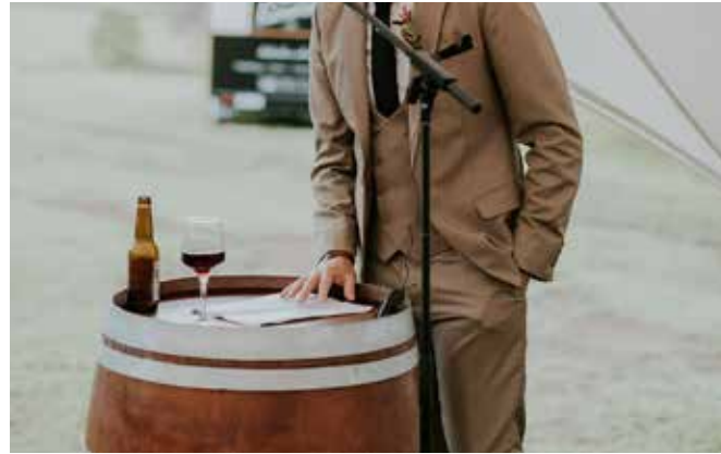
Wine Barrels 6 available