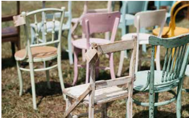
Mixed Vintage Chairs