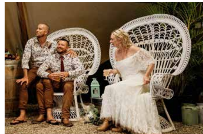
Peacock Chairs 2 available in white