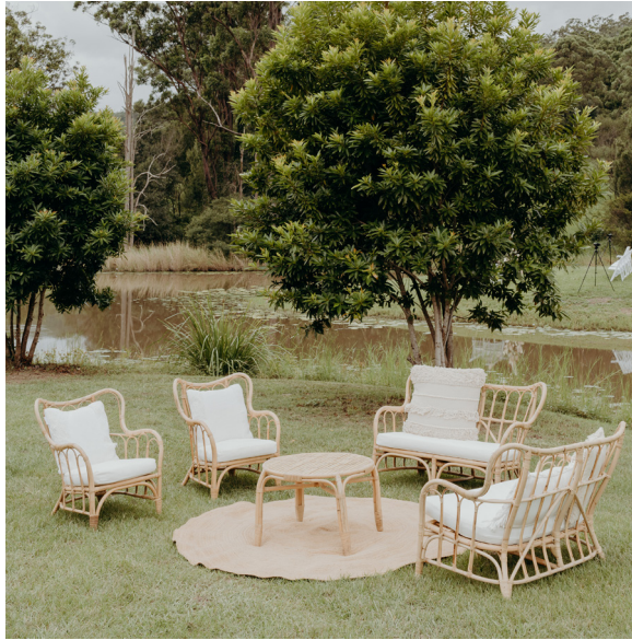
Cane Lounge Set