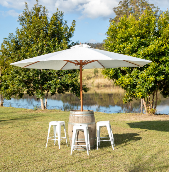
Wine Barrels, Bar Stools, Umbrellas