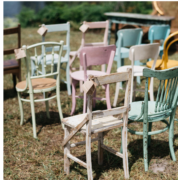
Mixed Vintage Chairs