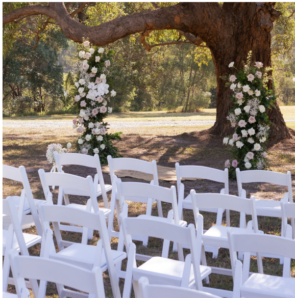
White Fold Chairs